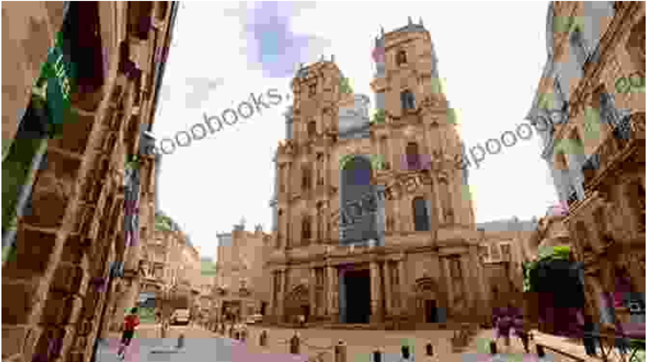
Rennes, Brittany's capital, is a vibrant hub of culture and history.