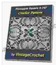
Image: [Alt text: A close-up image of a crocheted Pineapple Square 747, showcasing its intricate lacework and pineapple motif.]