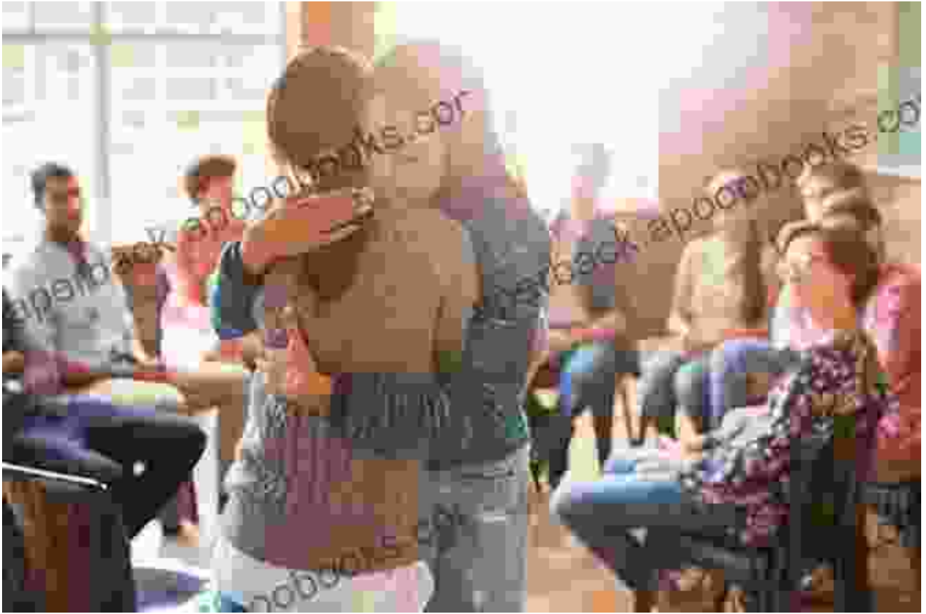
5. The Triumph of Resilience